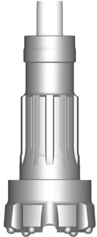
QL60 Bit Shank