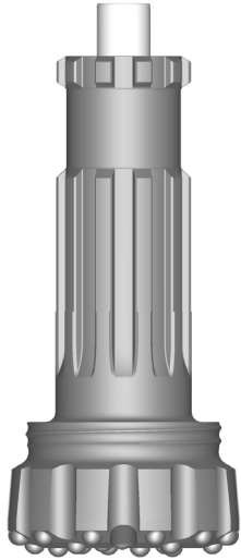
380 Bit Shank