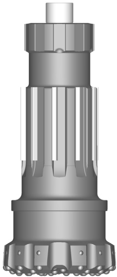
P125 NTR Bit Shank