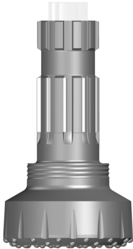
RC100 Bit Shank